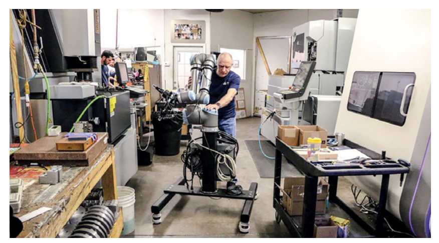
Cobots offer flexibility to be moved from one task to another, as shown in this rolling pedestal stand created by Texas-based All Axis Manufacturing.

He expects that RCM will have to leverage automation to restructure other work spaces, shifts, and even lunch times to keep workers safe. RCM isn't alone. For example, California's RSS Manufacturing has leveraged automation to